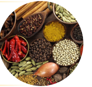
TABLE & KITCHENWARE